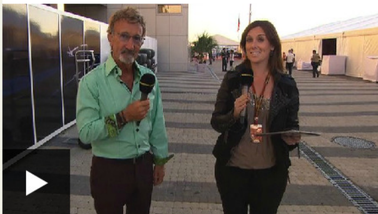
Inside F1 - including Jolyon Palmer interview

"I feel absolutely ready for it and I am confident it can happen."